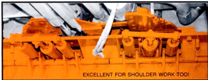
EXCELLENT FOR SHOULDER WORK TOO!